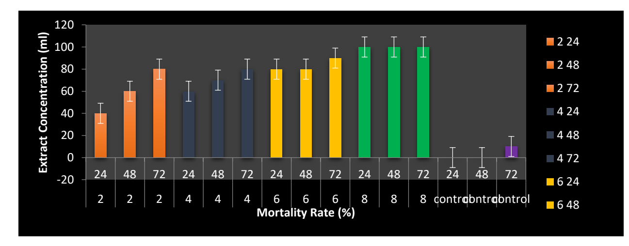
Figure 2: Mean distribution of C. chinense plant extract on mortality of S. oryzae after 24-72hours of exposure.

Values are means \pm standard deviation. Means in the same column having the same superscripts are not significantly different (p>0.05).