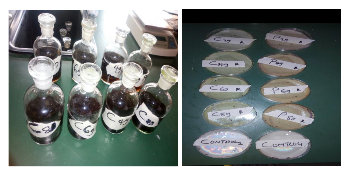
Plate 1: Plant extracts of Chromolaena odorata Plate 2: Plates containing weevils and Capsicum chinense

The specimens were subjected to natural desiccation at ambient temperature for a duration of 72 hours. The desiccated samples were individually mixed using a blender and then transferred to storage bottles. An electric weighing balance was used to measure the weight of each plant sample, which included 2 g, 4 g, 6 g, and 8 g, using a spatula. Each of the measured samples was transferred into a reagent container and appropriately labeled. Each reagent vial containing the samples was filled with 100 cc of 100% ethanol and left undisturbed for a period of 72 hours. The filtration process involved passing the substance through a Whattman filter paper positioned within a funnel. The remaining substance was disposed of and the liquid that passed through the filter was left to evaporate for a period of 24 hours.